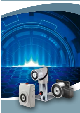
Hahn CQ Line