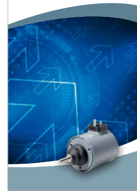
High Power Line