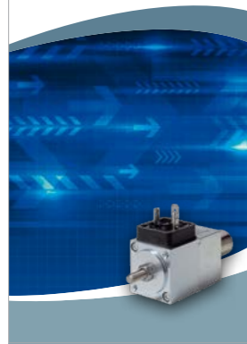
High Performance Line