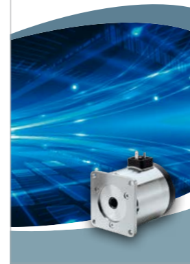
Control Power Line